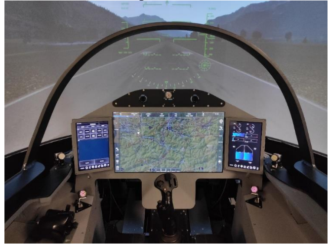
Figure 3: Cockpit simulator with integrated eye-tracking

The second step of this study was the implementation and evaluation of a cockpit adaption in a representative task setting. For this, we implemented 12 different adaption use cases in our cockpit simulator (see Figure 3). Cockpit adaptions were either a computer-generated text message or an indication on the tactical map.